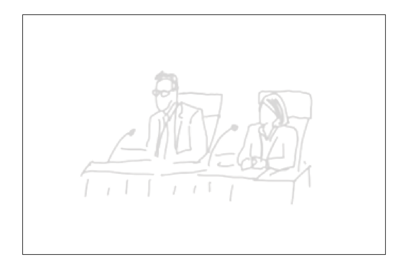
Please let us hear from you!!!